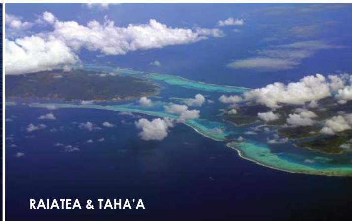
RAIATEA & TAHA'A