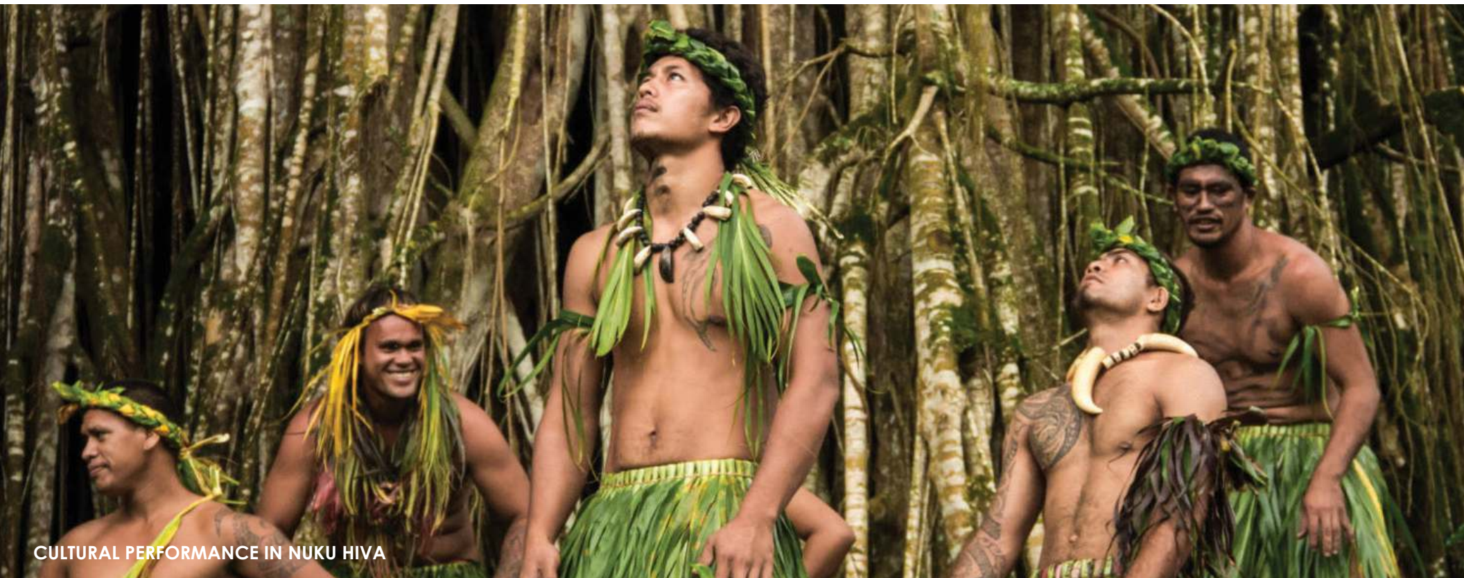
CULTURAL PERFORMANCE IN NUKU HIVA