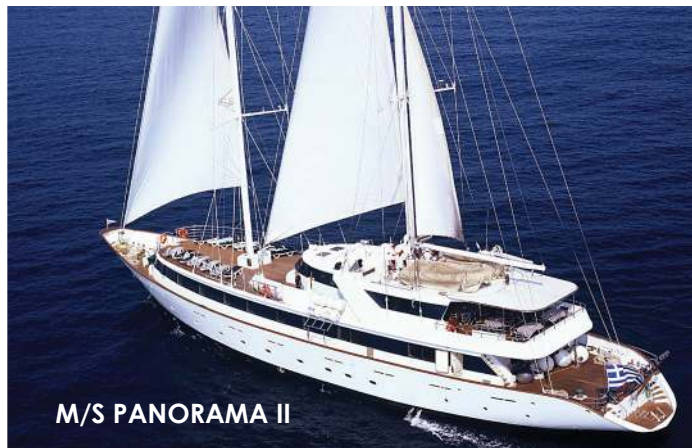
M/S PANORAMA II