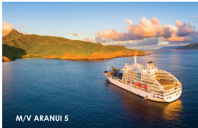
M/V ARANUI 5